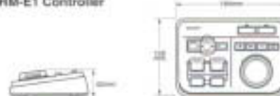
■ DSRM-E1 Controller

Video Walkman Attachment Unit Operating Instruction Manual