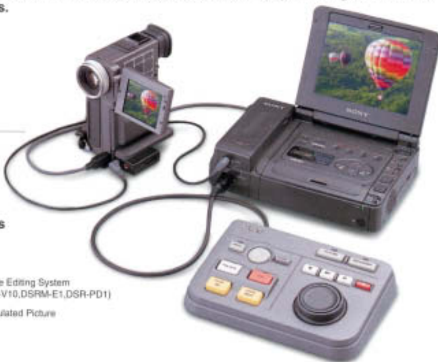
Simple Editing System (DSR-V10,DSRM-E1,DSR-PD1)